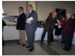
Waiting for the goodies