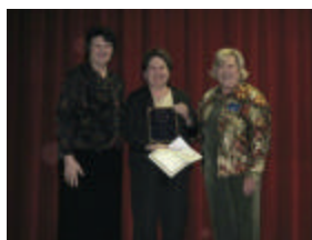
KAACE MEMBER OF THE YEAR