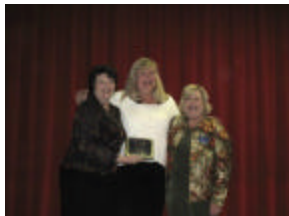
KYAE SUPPORTER OF THE YEAR